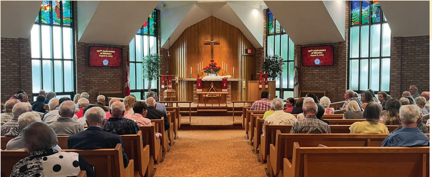
150th Anniversary Service at Zion - Dashwood, ON

Working through the President's Ministry Council (PMC) which includes ourselves, the President, and Vice President of Synod, we continue to implement the various strategic initiatives developed through LCC's Purpose and Priority Planning Process. These include initiatives to strengthen and revitalize congregations and enhance the structure and function of our Regional Mission and Ministry Councils (RMMCs) in support of our overall ministry. A significant focus of our work with the PMC has been on addressing the present pastoral shortage. Working with the Seminaries, (and we are very close!) we are identifying improved methods for equipping our ecclesiastical leaders to work within the current ministry paradigm. This includes overall pastoral formation and the development of new protocols within the Pastors with Alternate Training (PAT) program, to address the various needs and circumstances of our congregations.