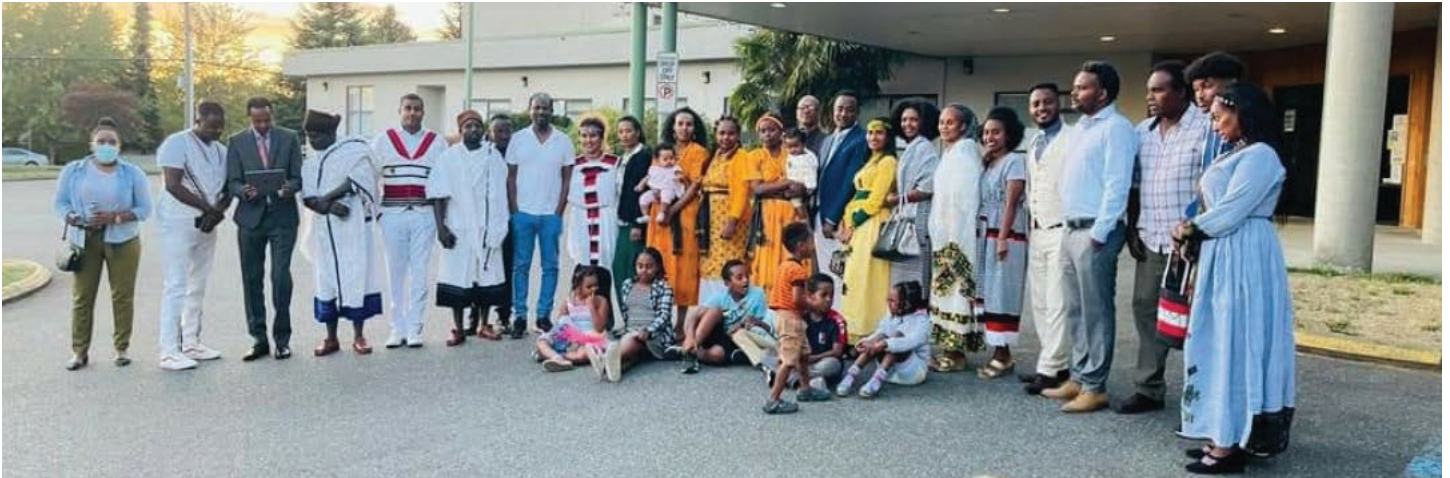
Oromo members at Faith - Surrey, BC

Domestically, the Lord has richly blessed our mission work across Canada leading us to establish new mission congregations in the last few years. I encourage you to visit the interactive mission map on our website to learn more about these missions and the work we are doing together. We continue to add content, further developing this resource for our members.