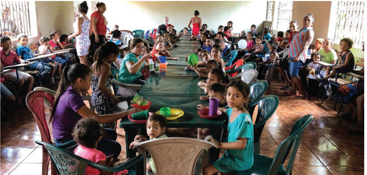
Pan de Vida/Bread of Life Feeding Program - Rancheria Chinandega, Nicaragua

In the past year, as we strove by the Spirit's guidance to declare the glory of God among the nations through the faithful proclamation of the Life-giving Gospel of our Lord Jesus, we faced several challenges and experienced many great blessings. Our objective in all that we do in our mission work together is to bring Christ Jesus into people's lives. We bring the love of Jesus through our various works of mercy, such as the Pan de Vida/Bread of Life Feeding Program in Nicaragua where we provide nutritious meals to hundreds of disadvantaged children in eight communities. Most vitally, we aim to bring the Life-giving Gospel of Jesus wherever the Lord leads us, whether it's through the pastors and deaconesses sharing the Gospel with the children that come to the Feeding Program; the continuing theological education that is provided to the church workers in all of our mission-fields; training new church workers and missionaries; or the evangelism work that we do alongside our sister and partner churches.