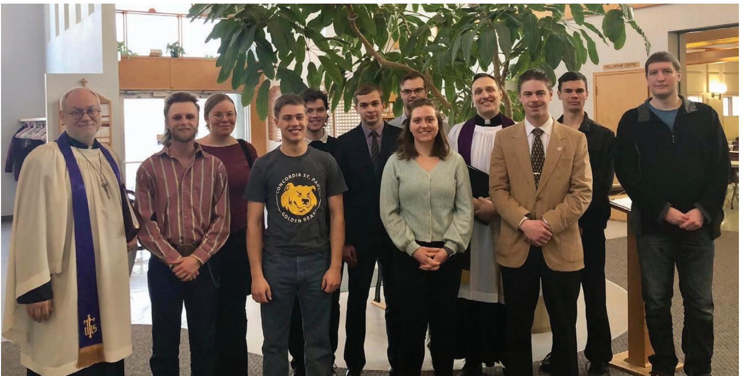
Young Adults Retreat at Mount Olive - Regina, SK

There are definitely challenges before our Synod in these days, such as demographic decline across the country and a shortage of pastors for congregations wanting to call. The temptations and attacks of Satan are always prevalent wherever the Word of God is proclaimed in truth and purity. But there are also many bright spots. We delight in congregations and circuits seeking to work together to ensure that each can receive our Lord's blessings in His Word and His Sacraments. We rejoice in the increasing Young Adult focused ministry occurring across our Regions and the intentional conversations to establish national Young Adult conferences. We are gladdened by the increase in numbers of a younger generation walking through the doors our congregations across the country. Many pastors have shared stories of soon-to-be new members, already having read the Book of Concord and having a strong understanding of Lutheran Biblical teaching. Truly the Lord is working on this generation as they look for truth and a solid foundation of faith to build their lives on.