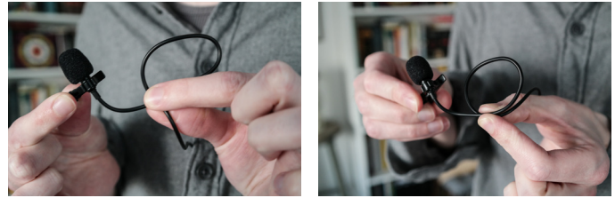
STEP 1: MAKE A LOOP WITH THE WIRE.