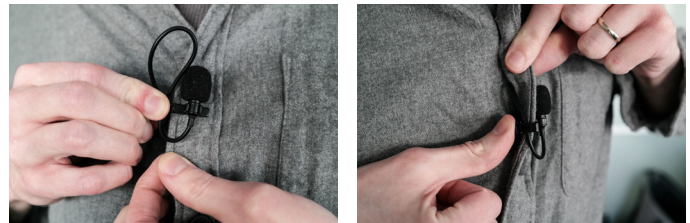
STEP 3: CLIP MIC TO SHIRT & TUCK IN WIRE.